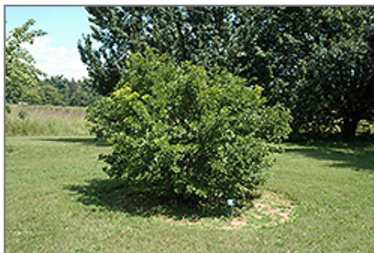
Jade Butterflies Ginkgo

Jade Butterflies Ginkgo is recommended for the following landscape applications;