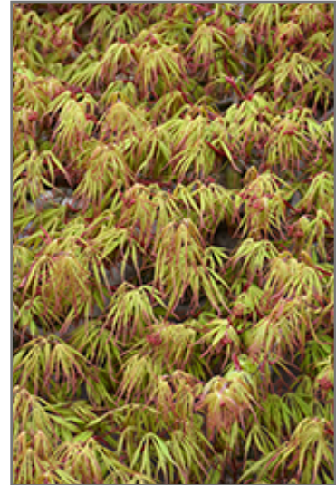
Spring Delight Japanese Maple foliage