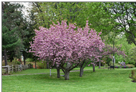
Kwanzan Flowering Cherry in bloom