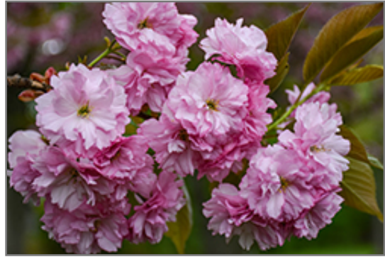
Kwanzan Flowering Cherry flowers

This tree should only be grown in full sunlight. It does best in average to evenly moist conditions, but will not tolerate standing water. It is not particular as to soil pH, but grows best in rich soils. It is highly tolerant of urban pollution and will even thrive in inner city environments, and will benefit from being planted in a relatively sheltered location. This is a selected variety of a species not originally from North America.