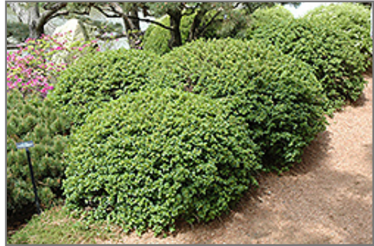
Green Mound Alpine Currant

This shrub performs well in both full sun and full shade. It is very adaptable to both dry and moist locations, and should do just fine under typical garden conditions. It is considered to be drought-tolerant, and thus makes an ideal choice for a low-water garden or xeriscape application. It is not particular as to soil type or pH. It is highly tolerant of urban pollution and will even thrive in inner city environments. This is a selected variety of a species not originally from North America.