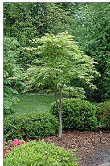
Osakazuki Japanese Maple