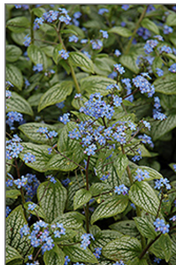
Silver Heart Bugloss flowers