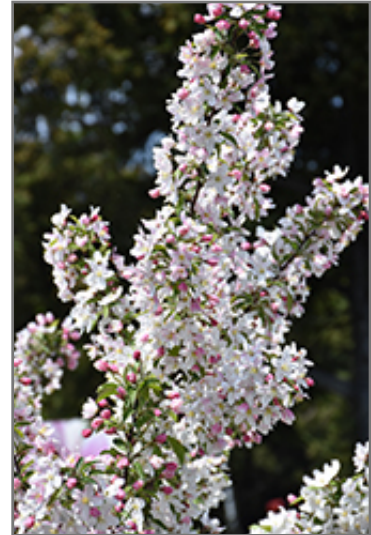
Lancelot Flowering Crab flowers