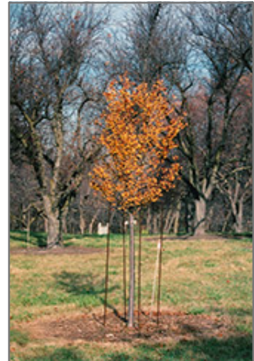
Lancelot Flowering Crab fruit

This shrub should only be grown in full sunlight. It prefers to grow in average to moist conditions, and shouldn't be allowed to dry out. It is not particular as to soil type or pH. It is highly tolerant of urban pollution and will even thrive in inner city environments. This particular variety is an interspecific hybrid.