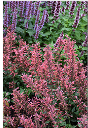
Kudos Coral Hyssop flowers

Kudos Coral Hyssop is a fine choice for the garden, but it is also a good selection for planting in outdoor pots and containers. With its upright habit of growth, it is best suited for use as a 'thriller' in the 'spiller-thriller-filler' container combination; plant it near the center of the pot, surrounded by smaller plants and those that spill over the edges. Note that when growing plants in outdoor containers and baskets, they may require more frequent waterings than they would in the yard or garden.