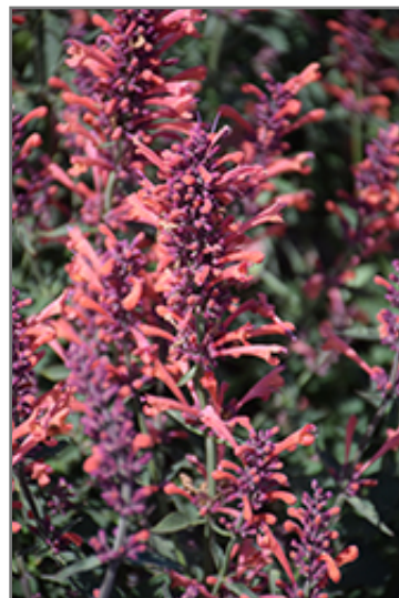
Kudos Coral Hyssop flowers