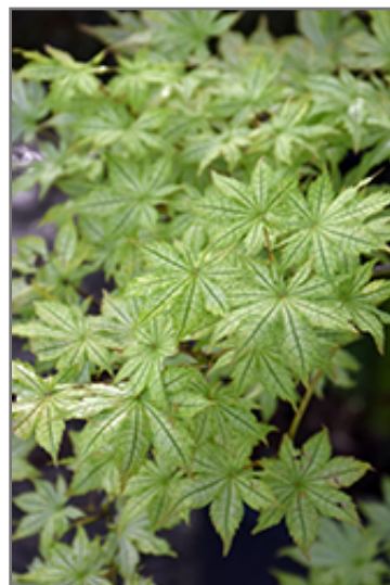
Shigitatsu Sawa Japanese Maple foliage