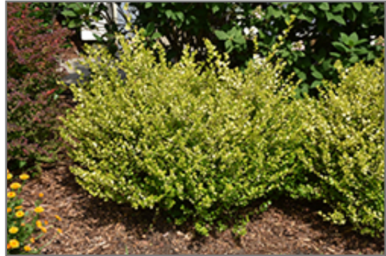
Cesky Gold Dwarf Birch