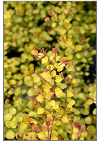
Cesky Gold Dwarf Birch foliage