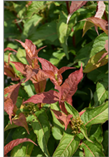
Kodiak Orange Diervilla foliage

Kodiak Orange Diervilla is recommended for the following landscape applications;