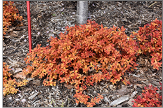
Double Play Candy Corn Spirea

This shrub should only be grown in full sunlight. It prefers to grow in average to moist conditions, and shouldn't be allowed to dry out. It is not particular as to soil type or pH. It is highly tolerant of urban pollution and will even thrive in inner city environments. This is a selected variety of a species not originally from North America.