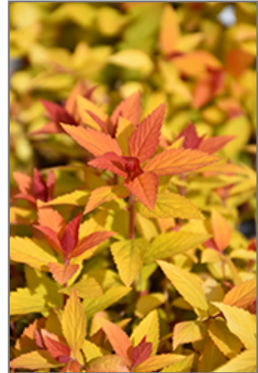
Double Play Candy Corn Spirea foliage

Double Play Candy Corn Spirea is recommended for the following landscape applications;