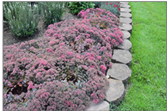
Popstar Stonecrop in bloom