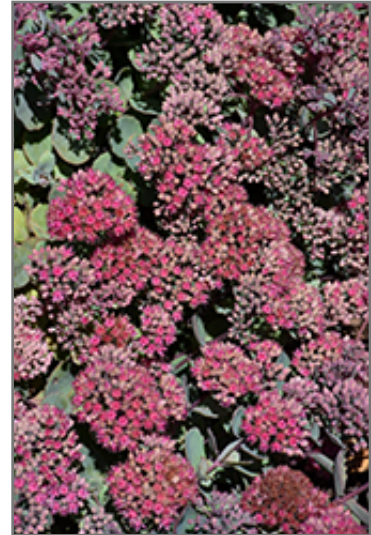
Popstar Stonecrop flowers

Popstar Stonecrop is a fine choice for the garden, but it is also a good selection for planting in outdoor pots and containers. It is often used as a 'filler' in the 'spiller-thriller-filler' container combination, providing a mass of flowers and foliage against which the thriller plants stand out. Note that when growing plants in outdoor containers and baskets, they may require more frequent waterings than they would in the yard or garden.