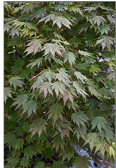
Northern Glow Maple foliage