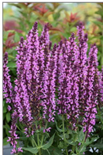
Pink Profusion Meadow Sage flowers

Pink Profusion Meadow Sage is recommended for the following landscape applications;