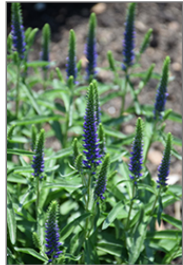
Magic Show Wizard of Ahhs Speedwell flowers

Magic Show Wizard of Ahhs Speedwell will grow to be about 12 inches tall at maturity extending to 16 inches tall with the flowers, with a spread of 22 inches. When grown in masses or used as a bedding plant, individual plants should be spaced approximately 18 inches apart. Its foliage tends to remain dense right to the ground, not requiring facer plants in front. It grows at a medium rate, and under ideal conditions can be expected to live for approximately 8 years. As an herbaceous perennial, this plant will usually die back to the crown each winter, and will regrow from the base each spring. Be careful not to disturb the crown in late winter when it may not be readily seen!