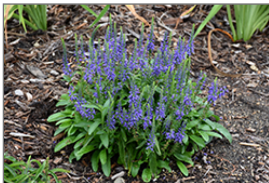
Magic Show Wizard of Ahhs Speedwell in bloom

This is a relatively low maintenance plant, and should only be pruned after flowering to avoid removing any of the current season's flowers. It is a good choice for attracting butterflies to your yard, but is not particularly attractive to deer who tend to leave it alone in favor of tastier treats. It has no significant negative characteristics.