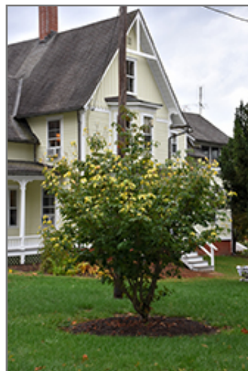
Champion's Gold Chinese Dogwood