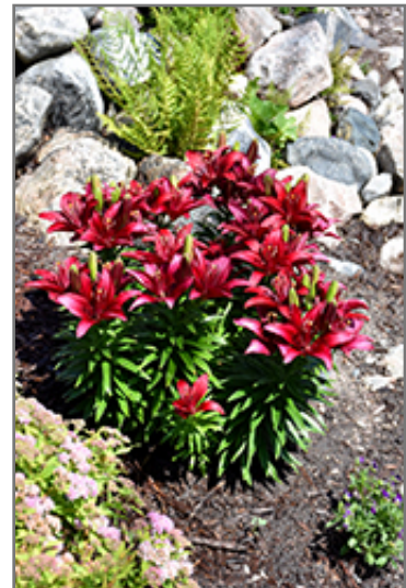
Lily Looks Tiny Rocket Lily in bloom