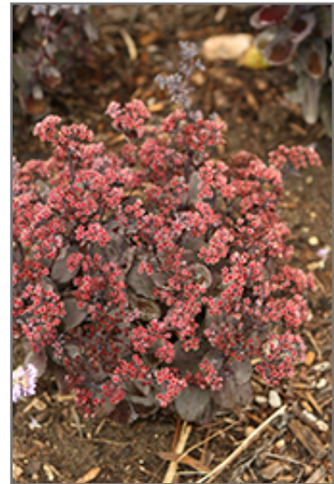
Rock 'N Grow Back in Black Stonecrop flowers

Rock 'N Grow Back in Black Stonecrop is a fine choice for the garden, but it is also a good selection for planting in outdoor pots and containers. With its upright habit of growth, it is best suited for use as a 'thriller' in the 'spiller-thriller-filler' container combination; plant it near the center of the pot, surrounded by smaller plants and those that spill over the edges. Note that when growing plants in outdoor containers and baskets, they may require more frequent waterings than they would in the yard or garden.