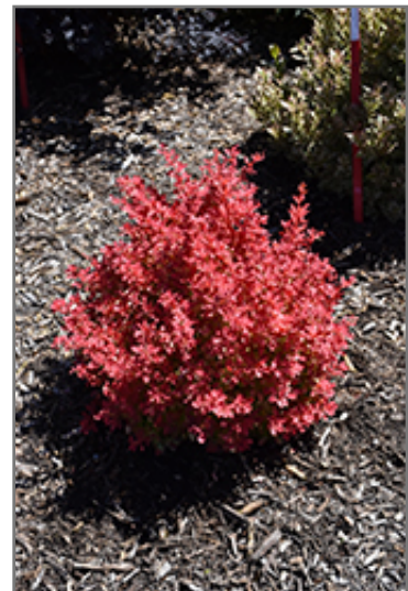
Sunjoy Neo Japanese Barberry