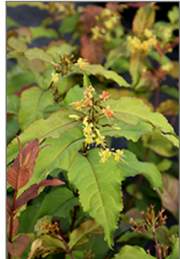
Kodiak Fresh Diervilla flowers