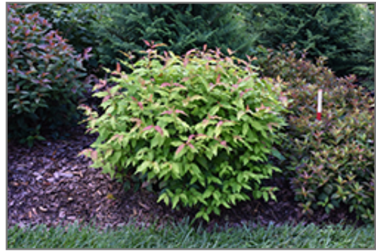
Kodiak Fresh Diervilla