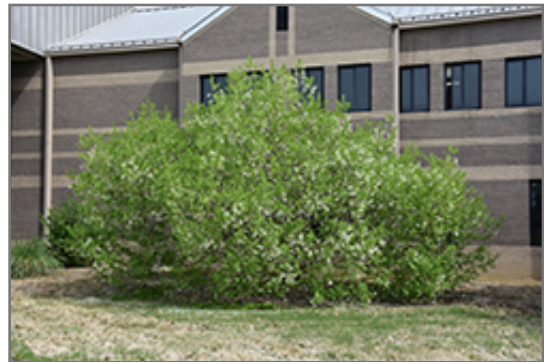
Emerald Knight Fringetree in bloom