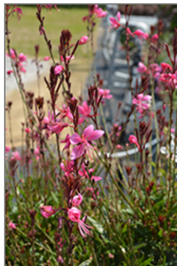
Steffi Dark Rose Gaura flowers

Steffi Dark Rose Gaura is recommended for the following landscape applications;