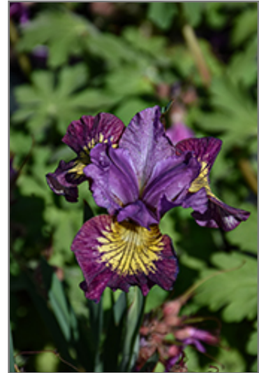
Miss Apple Siberian Iris flowers