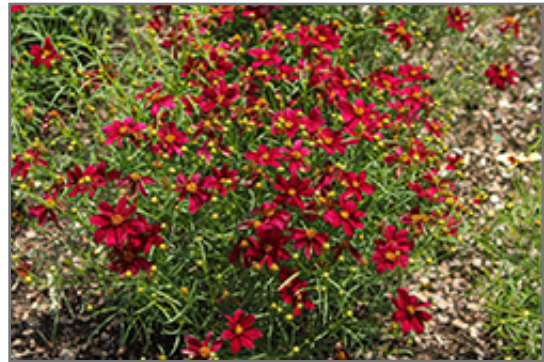
Designer Threads Scarlet Ribbons Tickseed flowers

Designer Threads Scarlet Ribbons Tickseed is recommended for the following landscape applications;