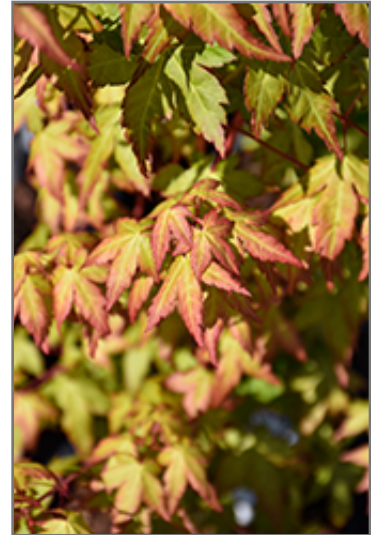
Bihou Japanese Maple foliage