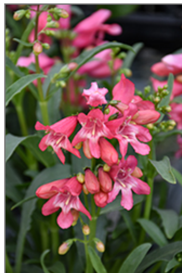
Bejeweled Pink Pearls Beard Tongue flowers