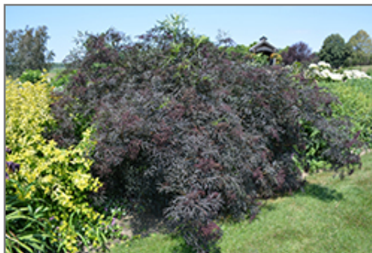
Black Lace Elder