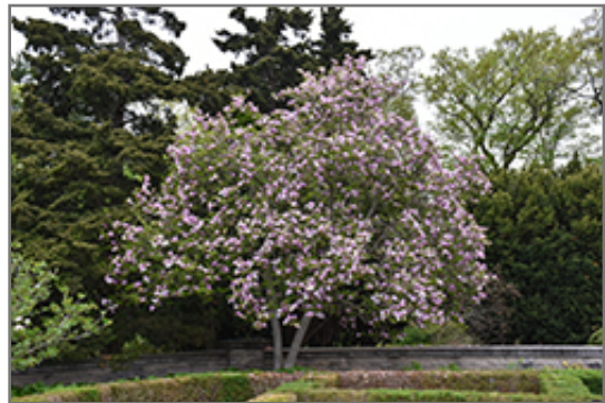
Jane Magnolia in bloom