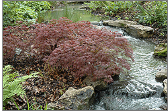
Inaba Shidare Cutleaf Japanese Maple

Inaba Shidare Cutleaf Japanese Maple will grow to be about 8 feet tall at maturity, with a spread of 8 feet. It tends to be a little leggy, with a typical clearance of 2 feet from the ground, and is suitable for planting under power lines. It grows at a medium rate, and under ideal conditions can be expected to live for 60 years or more.