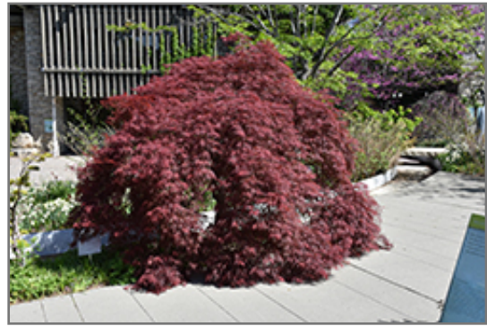
Inaba Shidare Cutleaf Japanese Maple

Inaba Shidare Cutleaf Japanese Maple is recommended for the following landscape applications;