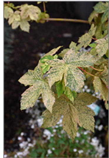
Eskimo Sunset Sycamore Maple foliage

This tree does best in full sun to partial shade. It prefers to grow in average to moist conditions, and shouldn't be allowed to dry out. It is not particular as to soil type or pH, and is able to handle environmental salt. It is highly tolerant of urban pollution and will even thrive in inner city environments. This is a selected variety of a species not originally from North America.