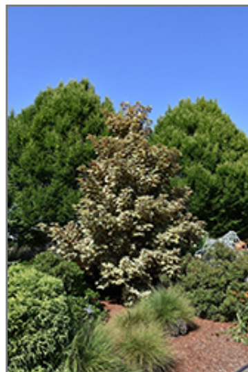
Eskimo Sunset Sycamore Maple