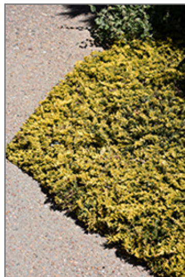
Mother Lode Juniper