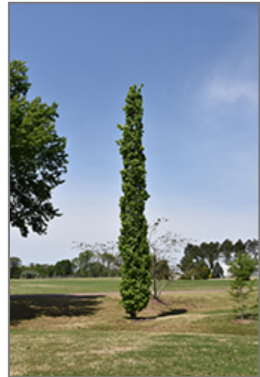
Slender Silhouette Sweet Gum