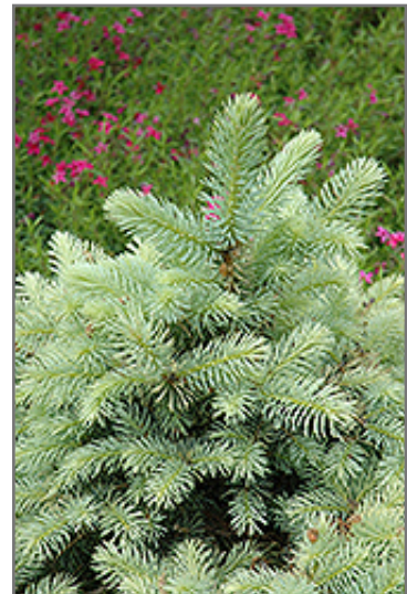
Walnut Glen Blue Spruce foliage