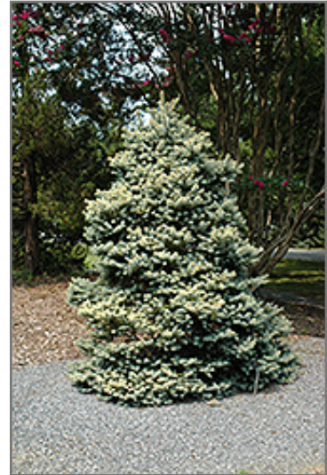
Walnut Glen Blue Spruce

Walnut Glen Blue Spruce is recommended for the following landscape applications;